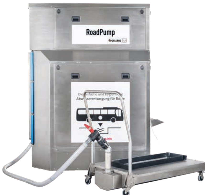
RoadPump Plus and CollectingMax