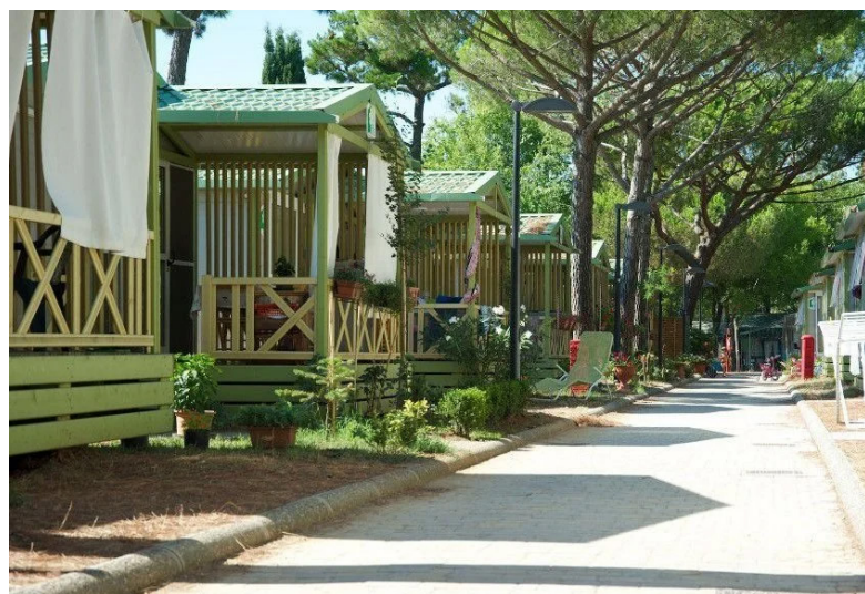
Camping Piper in Italy

For the Pecchia family that means, they need to open the underground pit, pulling out the pump and solve the clogging. In addition to the extra effort of 3-4 hours each time in the strainful summer season, unpleasant odors come out of the pit and affect the camping experience of the guests.