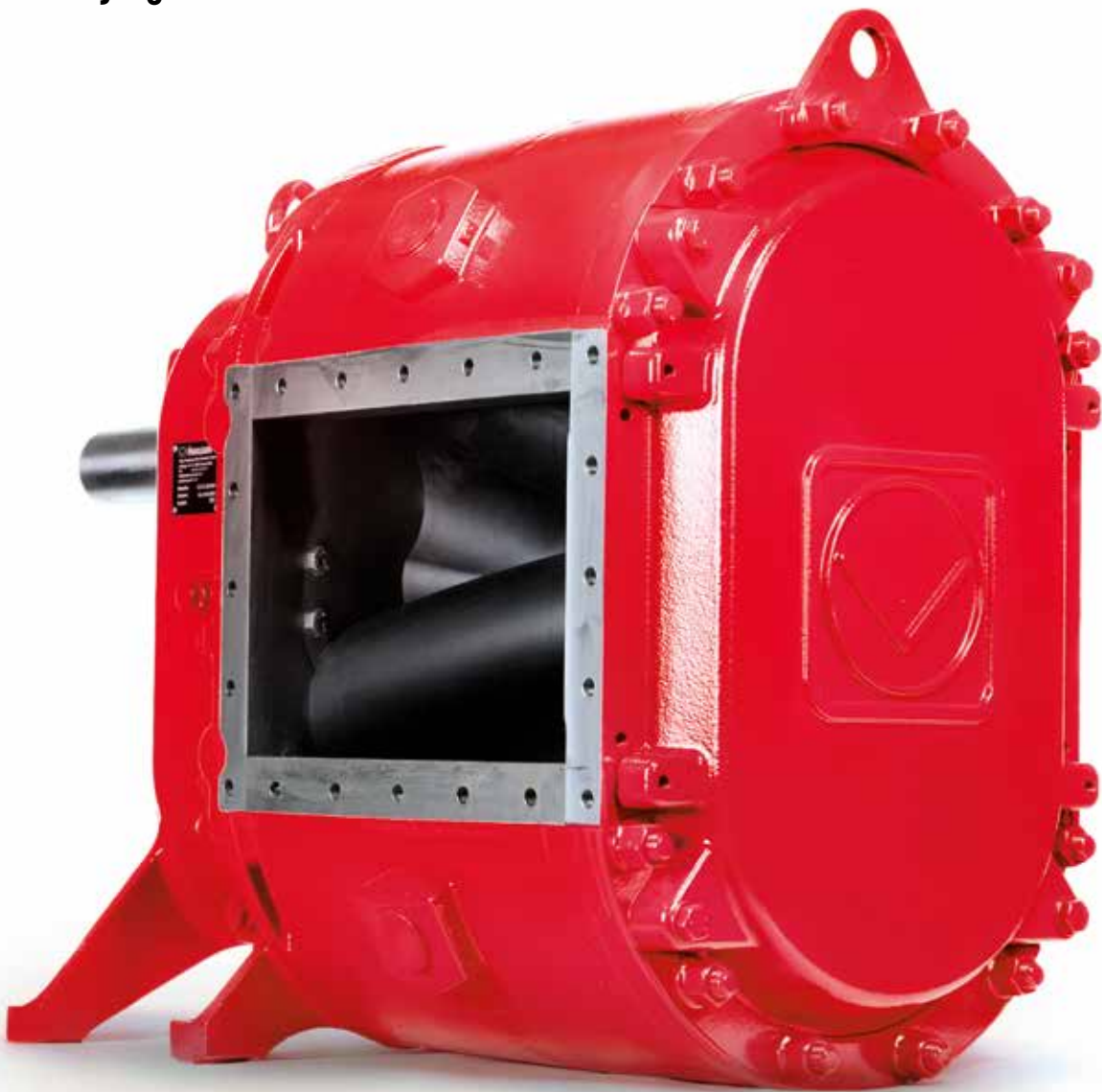
Service- and maintenance-friendly: the VX series rotary lobe pumps

Vogelsang rotary lobe pumps: The efficient choice for a wide variety of conveying tasks